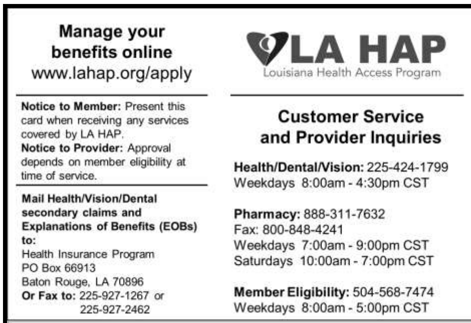
Back of Card

The LA HAP card serves to verify eligibility only. Non-drug claims cannot be adjudicated at point of care. Insured HIP clients should first present their primary private insurance card for adjudication. Any remaining copay, coinsurance or deductible should then be billed to HIP via submission of a claim form within 180 days.