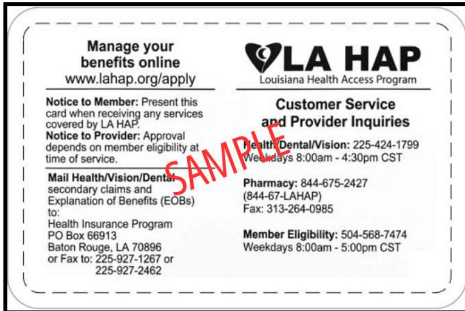
Back of Card

The LA HAP card serves to verify eligibility only. Non-drug claims cannot be adjudicated at point of care. Insured HIP members should first present their primary private insurance card for adjudication. Any remaining copay, coinsurance or deductible should then be billed to HIP via submission of a claim form within 180 days.